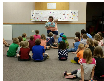
Photo right: Students at story time during the end of the year celebration.

The Traveling Tree House is made possible by the United Way of Douglas & Pope Counties Power of Women Group.