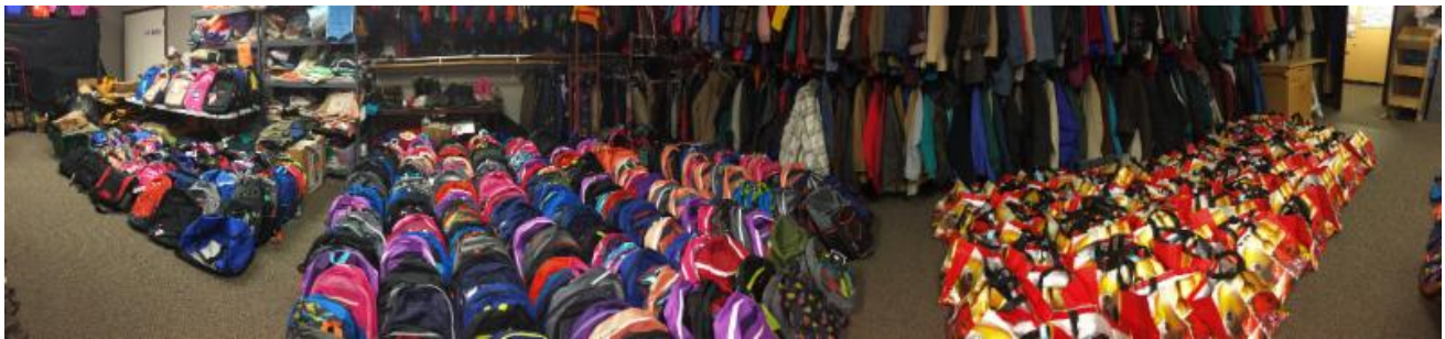
Panoramic view of our Community Coat Room full of backpacks ready for Stuff the Bus distribution.

We wrapped up our Stuff the Bus program on August 18th by distributing 515 backpacks full of necessary school supplies to registered area students. Thank you to all the community members and businesses who collected and donated school supplies!