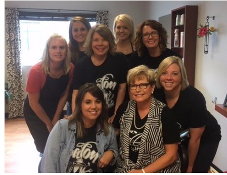
(Left) Volunteers from 3M pack backpacks at our office. (Center) Hundreds of school bags lined up in our backroom, ready for distribution. (Right) Stylists from Ella's Salon who provided free haircuts for registered Stuff the Bus students.