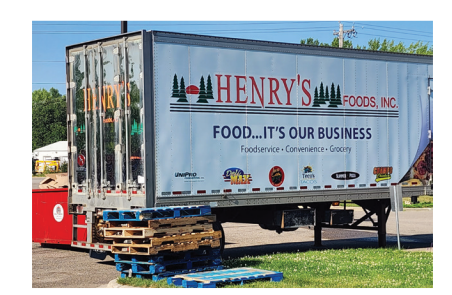
Henry's Foods supports Food Drops and Backpack Attack by providing products, storage and transportation of food items.

Douglas Machine Foundation Emergency Food & Shelter Program Alexandria Community Foundation Community Giving West Central Initiative