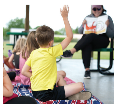
Kids enjoy story time at the Traveling Tree House.

Stewardship, Trustworthy, Respect, Community Collaboration, Innovation