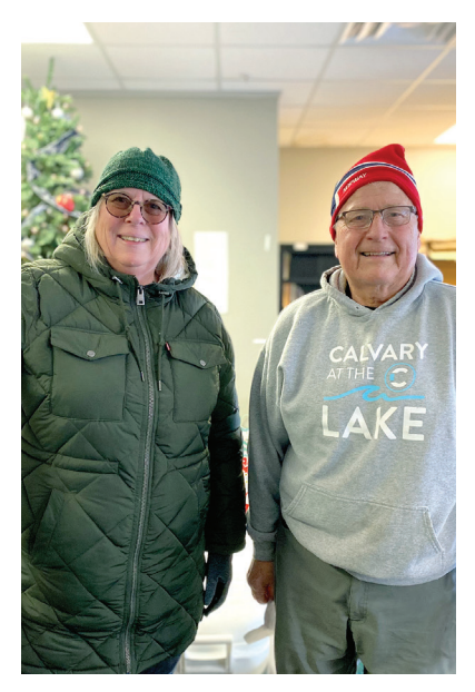
Friends of United Way voulnteer to help out with our Holiday Gift Program.

Visit uwdp.org and search "Speed Volunteer"